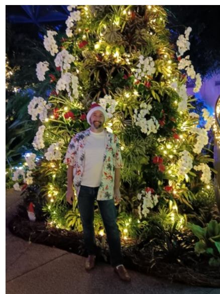
My family recently visited the Greater Des Moines Botanical Garden for their Dome After Dark event. They had a number of displays, including this towering "tree" formed from a variety of tropical botanicals and large, white Phalaenopsis.